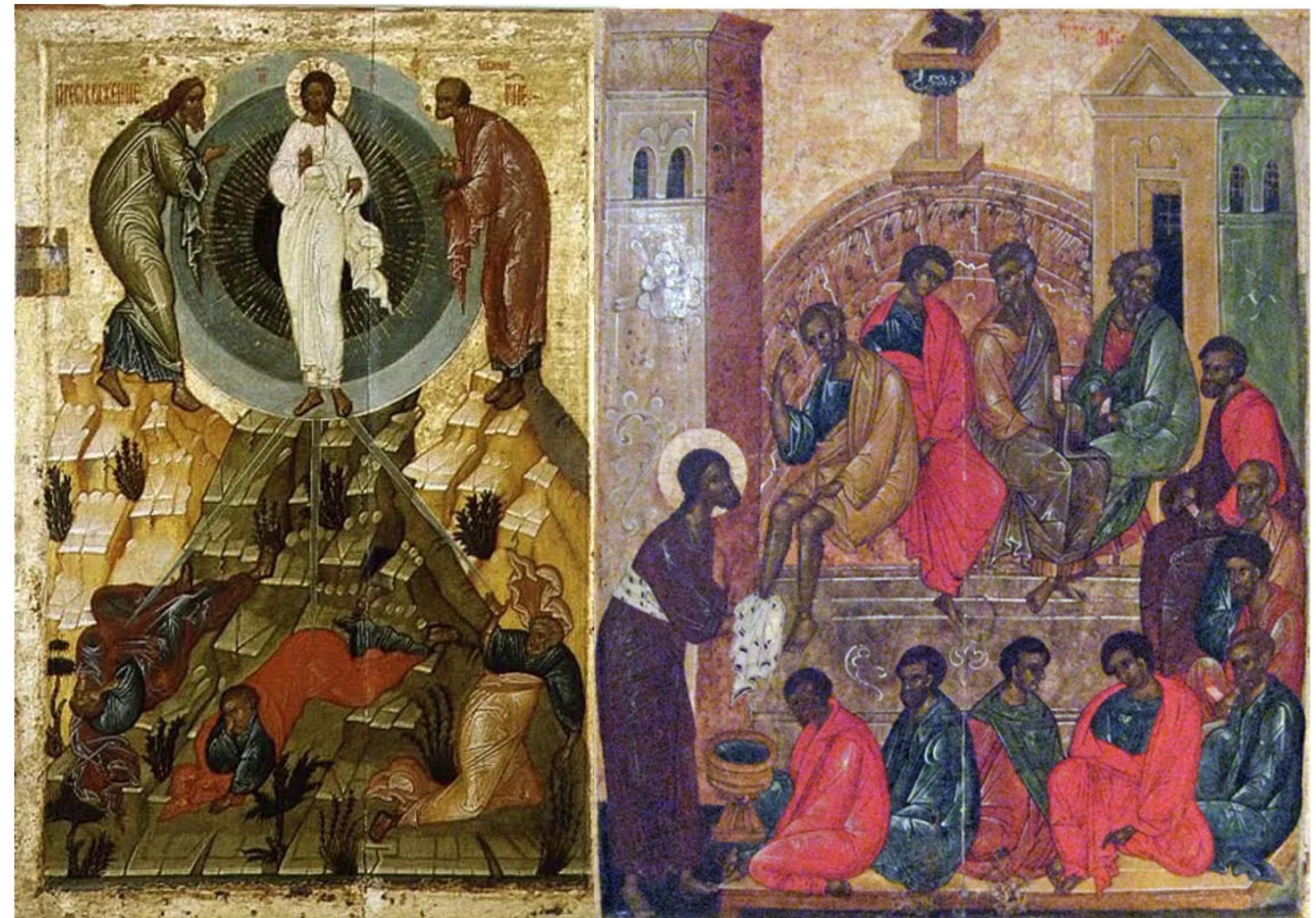
Russian Icons from the 17th Century - Christ with the disciples

- If we wish to escape these cursed conditions and receive The Kingdom of Heaven, we must repent and keep God's Laws.(Deuteronomy 30:1-3)